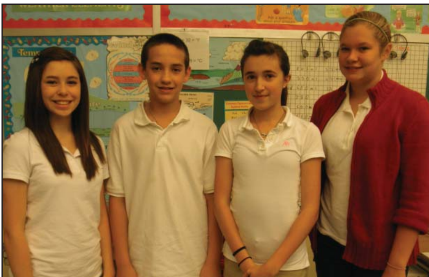
2011-2012 Student Council Officers

Prayer of St. Ursula Feast Day Oct. 21 O Glorious St. Ursula, instructor of the young and guardian of virtue, help us heed your fine example. Assist us to follow in your footsteps. May we learn to love and serve our Lord and trust in His goodness. We ask this through Christ our Lord, from Whom all blessings come. Amen.