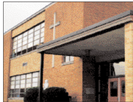
WEB SITE PHOTO

portant to me is math. Math is important because you need it for almost everything."