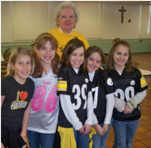
Steelers Girls with the Head Coach!

The School Advisory Council was created in August 2008 following Diocesan Guidelines and is comprised of Student Life, Budget and Finance, Enrollment Management, Vision and Planning, Athletics Association and Fund Raising.